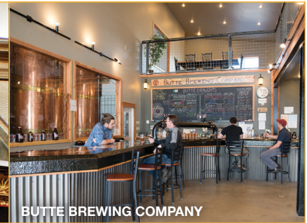
BUTTE BREWING COMPANY