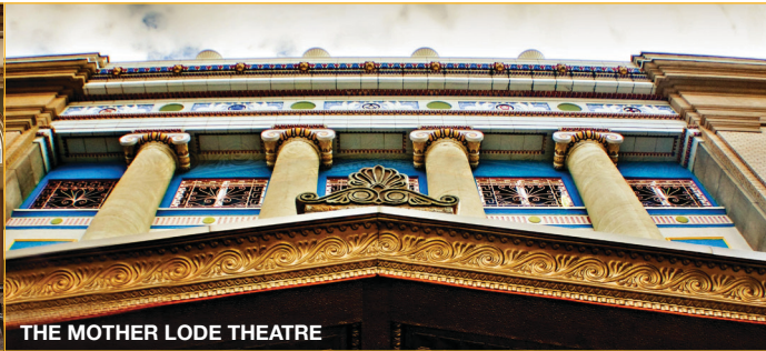
THE MOTHER LODGE THEATRE