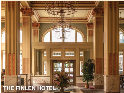
THE FINLEN HOTEL